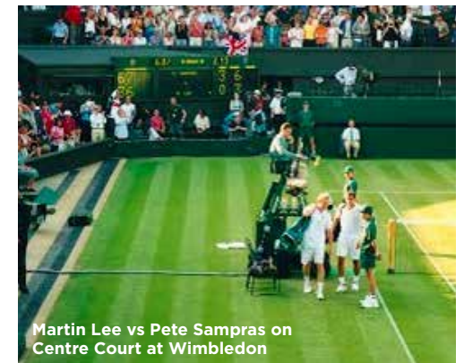
Martin Lee vs Pete Sampras on Centre Court at Wimbledon